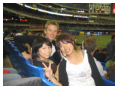
Bluejays hit a home run!